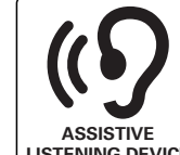
ASSISTIVE LISTENING DEVICE

Use the QR code to search for an interpreter by Ohio county